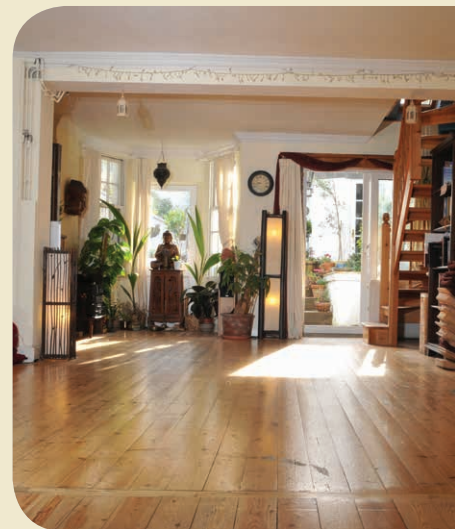
Below: Unity Studio Brighton