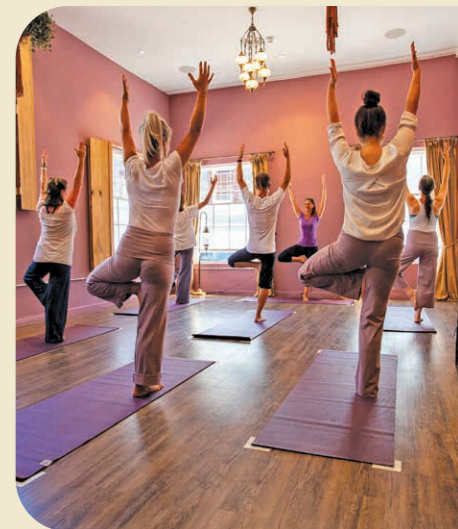
Below: Unity Centre Lewes